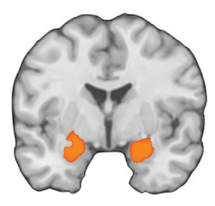
Figure 2. Results of the meta-analysis of brain regions modulated by reappraisal (y = -3; emotional baseline > reappraise).